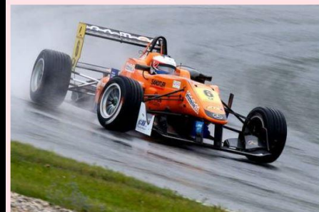
Drömmar om F1 21-årige Felix Rosenqvist ligger tvåa i EM inför helgens tävlingar. Nu hyllas han av den forna världsmästaren Damon Hill.

Rosenqvist jagar F1: "Ni har en bra förare på gång"