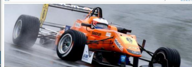
Felix Rosenqvist.